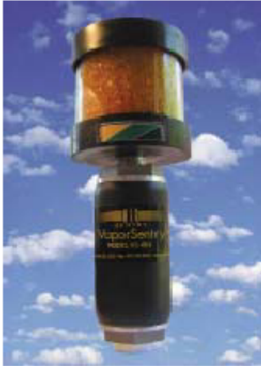
Model VS-601 VaporSentry™ shown with Z-134 breather

Pumps, gearboxes, and some hydraulic systems generate heavy oil mist, which is thrown up and out, or simply migrates, through the vent. This oil mist forms droplets of oil on the outside of the equipment creating an environmental issue, a safety issue, and ongoing clean-up procedures. If a desiccant breather is being used on the equipment, its useful life can be significantly shortened.