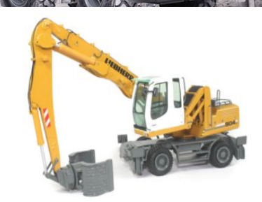
D.P. Metal Inc. 373A Chemin Grande-Ligne Saint-Urbain Premier, QC CA J0S 1Y0 Contact: Service .