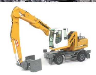
D.P. Metal Inc. 373A Chemin Grande-Ligne Saint-Urbain Premier, QC CA J0S 1Y0 Contact: Service .