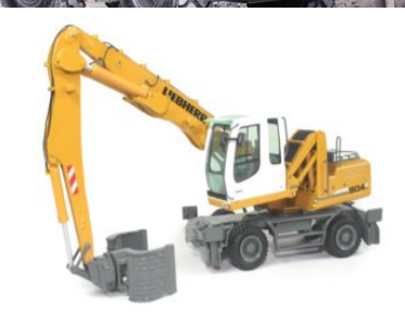
D.P. Metal Inc. 373A Chemin Grande-Ligne Saint-Urbain Premier, QC CA J0S 1Y0 Contact: Service .