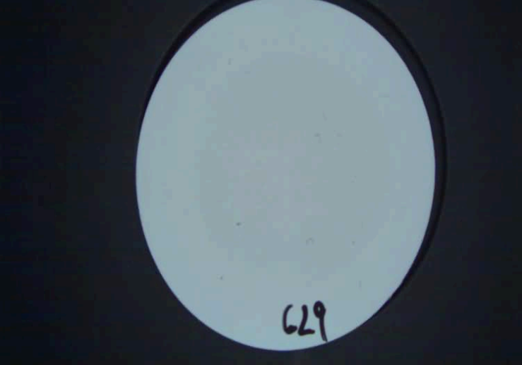
MPC (Varnish Test)