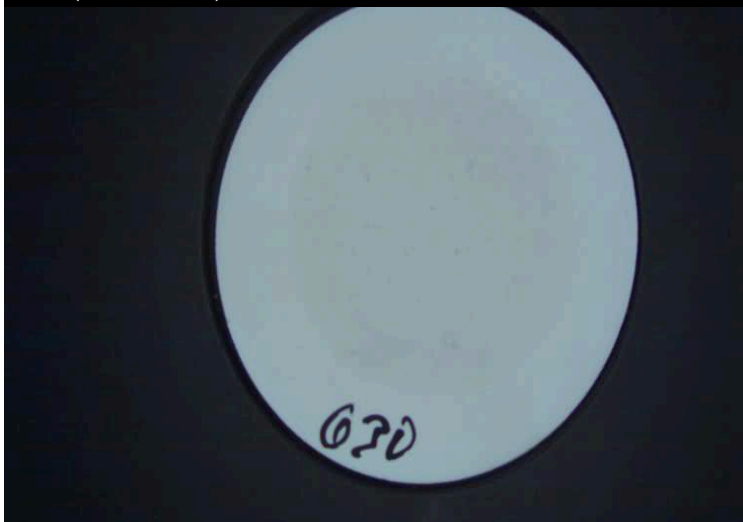
MPC (Varnish Test)