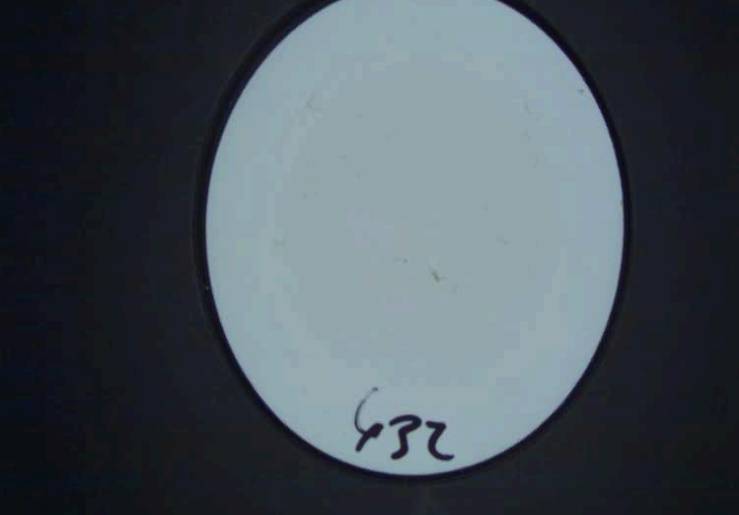
MPC (Varnish Test)