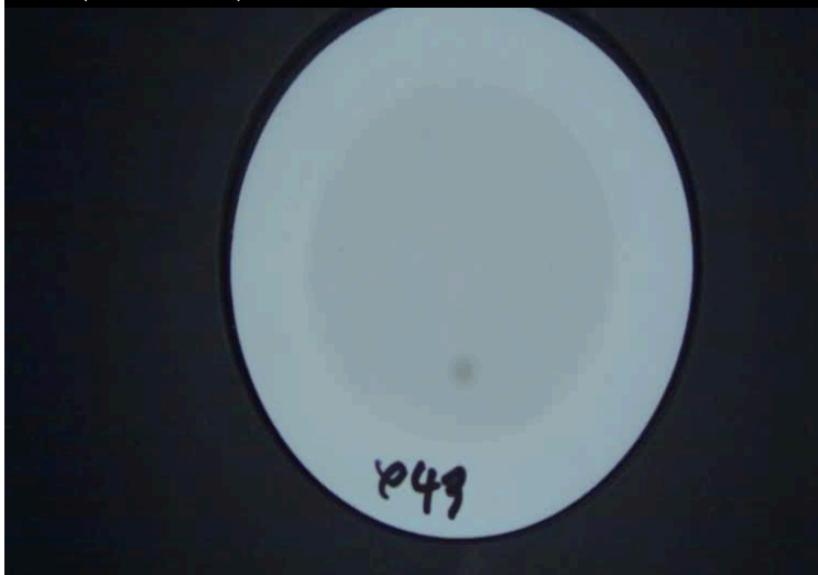
MPC (Varnish Test)