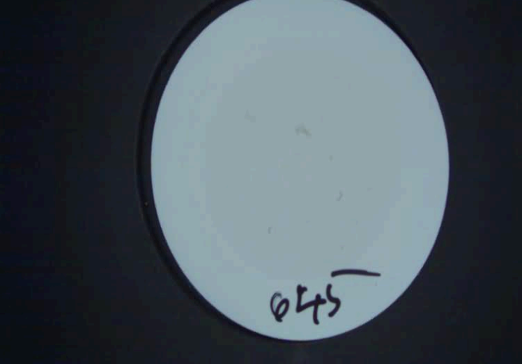
MPC (Varnish Test)