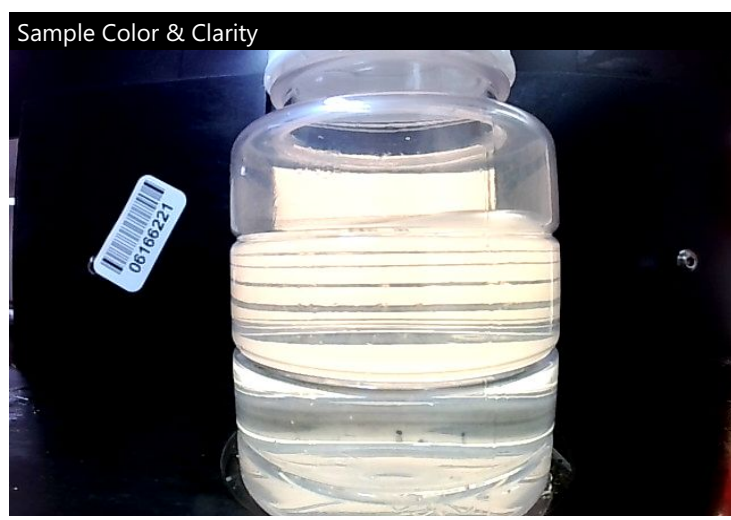
Report Id: SCOSAI [WUSCAR] 06166232 (Generated: 05/30/2024 22:25:53) Rev: 1