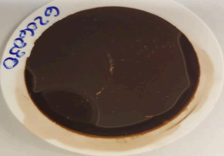
MPC (Varnish Test)