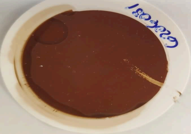
MPC (Varnish Test)