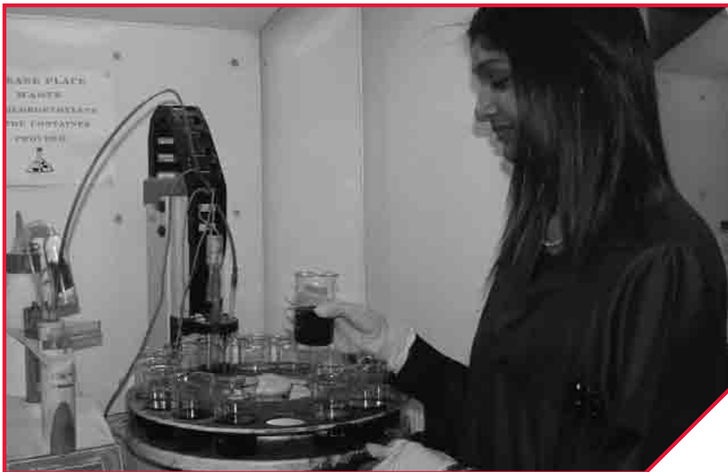
A technician testing oil samples for neutralisation additives

Nitrogen fixation from the atmosphere can generate nitrogen-based acids through a similar mechanism and these also need to be neutralised in the same manner to avoid damage to both the oil and the equipment. This becomes more of an issue with high combustion temperatures found in gas engines.