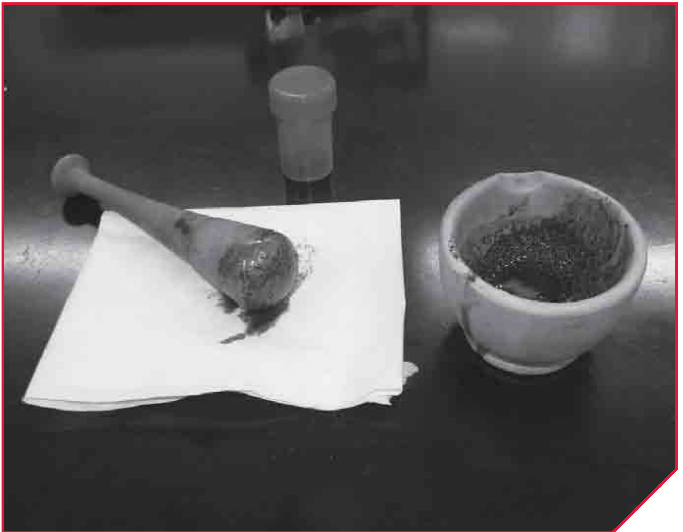
Sludge like this is often found at the bottom of many sumps

Filtration: A commonly-asked question is: can an oil filter remove the additives from the oil? This is most often asked when ultra-filtration or centrifugal filters are being used on engines. Can this super-fine filtration damage the oil additive package? Essentially, no, the filter will not remove additives. It is possible for a filter to remove the anti-foamant additive as the molecules are quite big and can form micelles, however, the other additives will all be well less than one tenth of a micron