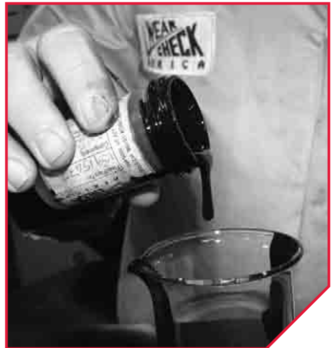
An engine oil sample with a very high viscosity due to overheating

A question that is often asked is 'What is the maximum temperature that this oil can withstand?' Unfortunately there is no answer as the lifetime of the oil is not only dependent on operating temperature but time as well. So, what we need to know is, how hot and for how long? An engine oil might happily deal with 150°C for an hour or so but degrade severely at 100°C over a longer period of time.