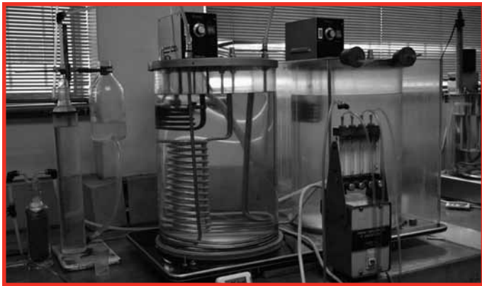
Foam presence and stability testing

Demulsibility: This test measures the ability of the oil to separate from water. Trace amounts of water will dissolve in turbine oils (50-100 ppm) but free and particularly emulsified water can do a large amount of damage. Water contamination can lead to corrosion, accelerated oxidation, film strength loss, cavitation and filter plugging.