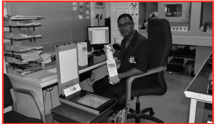
A laboratory technician measures the VPR of a turbine oil

This increases the stability of both oxidation and viscosity of these oils but unfortunately, the 'undesirables' are natural solvents for varnish.