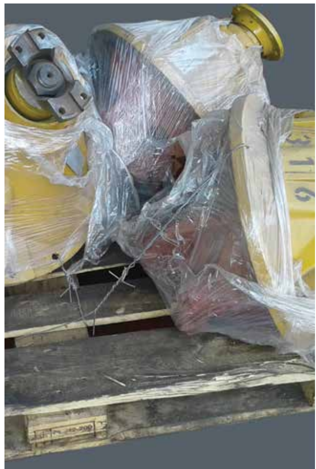
A stock of differentials as part of the maintenance planning and downtime minimisation strategy.

Inspect the drain plug for presence of excessive particles.